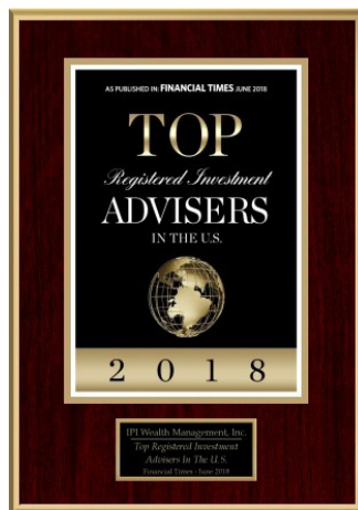
Top Registered Investment Advisers In The U.S. Financial Times - June 2018