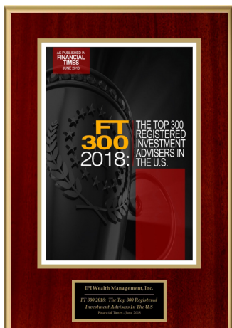
FT 300 - Top RIAs In the U.S. Financial Times - June 2018

In 2018, IPI Wealth Management, the RIA, was recognized for the following: