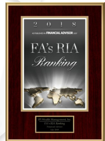
FA's RIA Ranking Financial Advisor - July 2018